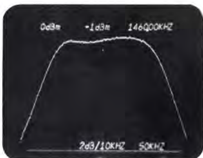
Spectrum analyzer response of Flat-Pass output network maximizes mono and stereo performance.

Exceptionally high overall efficiency; maximum reliability; improved audio performance; full service microprocessor control and status monitoring; readiness for AM Stereo—these are just a few of the features in the SX-2.5 broadcast transmitter. Never before has Harris incorporated as many benefits in today's transmitter for today's broadcaster, with an advanced design to ensure years of reliable operation.