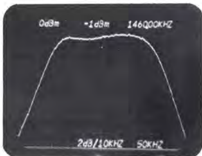
Spectrum analyzer response of Flat-Pass output network maximizes mono and stereo performance.

Low, Medium and High —Independent tri-power levels can be set to any value for each of the three power control buttons. The illuminated button indicates which power level is operating. No contactor or power transformer tap changes are required.