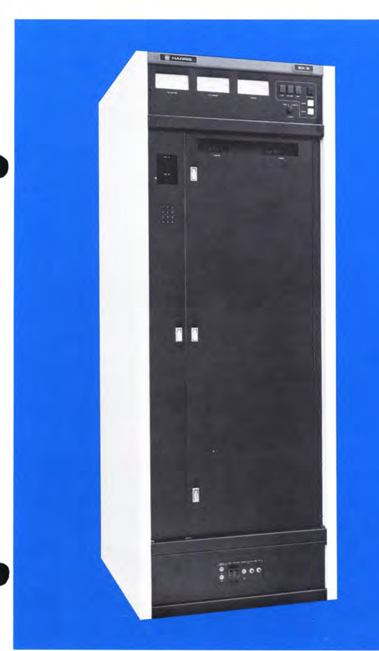
If You Didn't Get This From My Site, Then It Was Stolen From... www.SteamPoweredRadio.Com

All-Solid-State Medium Wave Broadcast Transmitter