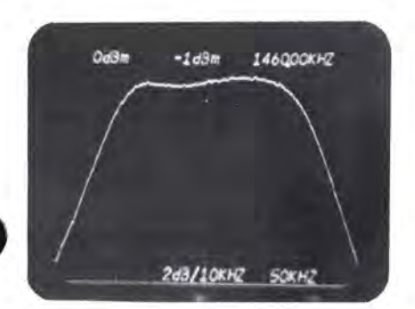
Spectrum analyzer response of Flat-Pass output network maximizes mono and stereo performance.

Low, Medium and High—Independent tri-power levels can be set to any value for each of the three power control buttons. The illuminated button indicates which power level is operating. No contactor or power transformer tap changes are required.