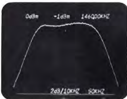
Spectrum analyzer response of Flat-Pass output network maximizes mono and stereo performance.

The Customer Interface Panel provides the user with a centrally located point for all external interface equipment